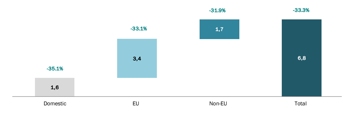
Breakdown of traffic using the Roman airport system in QI 2020 (millions of pax and change QI 2020 vs QI 2019)

From 20 February, Fiumicino registered a reduction in passengers of over 2.8m compared with the same period of the previous year (a fall of 66.2%), accompanied by a decline in movements of approximately 15,700 (down 50.6%). The fall accelerated in March, following the Government's introduction of restrictions on flights to and from Italy from the second half of the month.